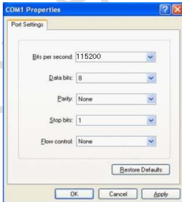
COM port properties

After turned on the power, there is boot information printing. After startup, press enter and